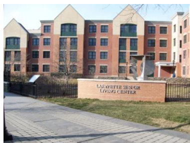
Lafayette Senior Living Center.

We would like to thank JCHA's Executive Director and Board of Commissioners, along with Jersey City officials and many dedicated community groups, for being strong partners in our effort to revitalize this neighborhood.